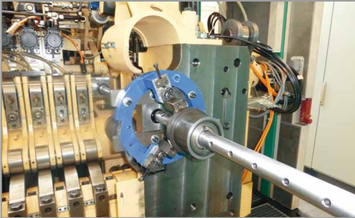
Rework can be carried out on existing machines, opening up completely new possibilities.

rangement. In general, temperatures of up to around 600 °C are possible. In individual cases, such as for small throughputs, the temperatures can even be higher than this.