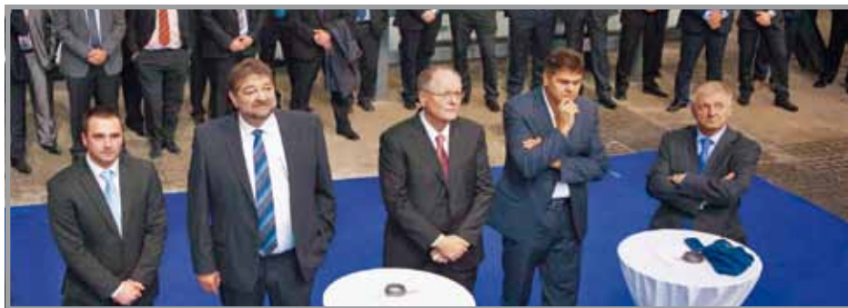
Guests paying rapt attention during the inauguration celebrations.

PD: The entire logistics concept has changed or has been adapted in line with