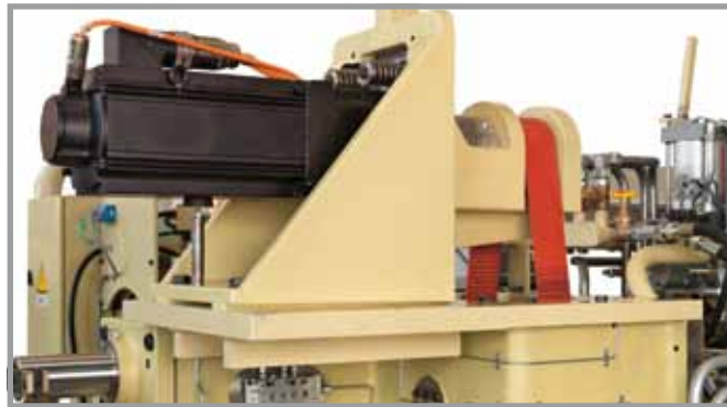
The servo infeed on the AMP 30 opens up new possibilities.

The infeed no longer takes place using a cam and a free wheeling device. This opens up new possibilities. The bars can be moved up and slowed down gently. This allows unnecessary overstrokes to be kept to a minimum. In addition, the operator can adjust the cut-off length on the control panel. Naturally, the cut-off length is coupled with the stop, and both are adjusted to the required dimension at the same time, even