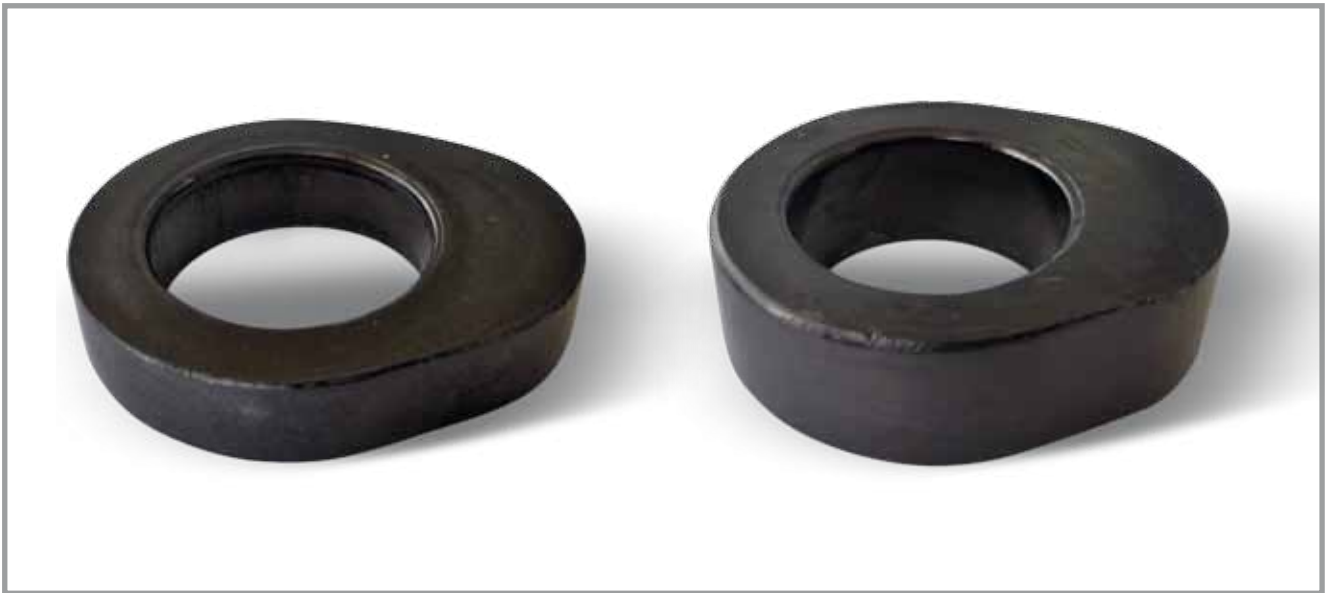
The new, 8 mm thick cam will supersede the widely used 12 mm cam (right) in the future.

To determine a point of orientation, we started off with the same cam geometry but with a thickness of 12 mm. These values were then used as the basis for working towards the thinner design. Naturally, the classic problems such as material distribution were more pronounced. In