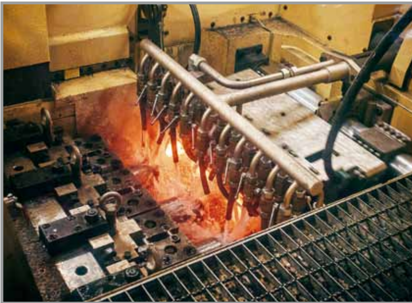
During the opening ceremony on November 21st 2013, the tool area of the Hotmatic AMP 50 was, by way of exception, open to view.

PD: The average duration of the process is between two and a half and three hours. Over the last few months, OMNIA KLF has also invested significantly in training and peripheral equipment in this area as well, in order to reduce changeover times to around 90 minutes.