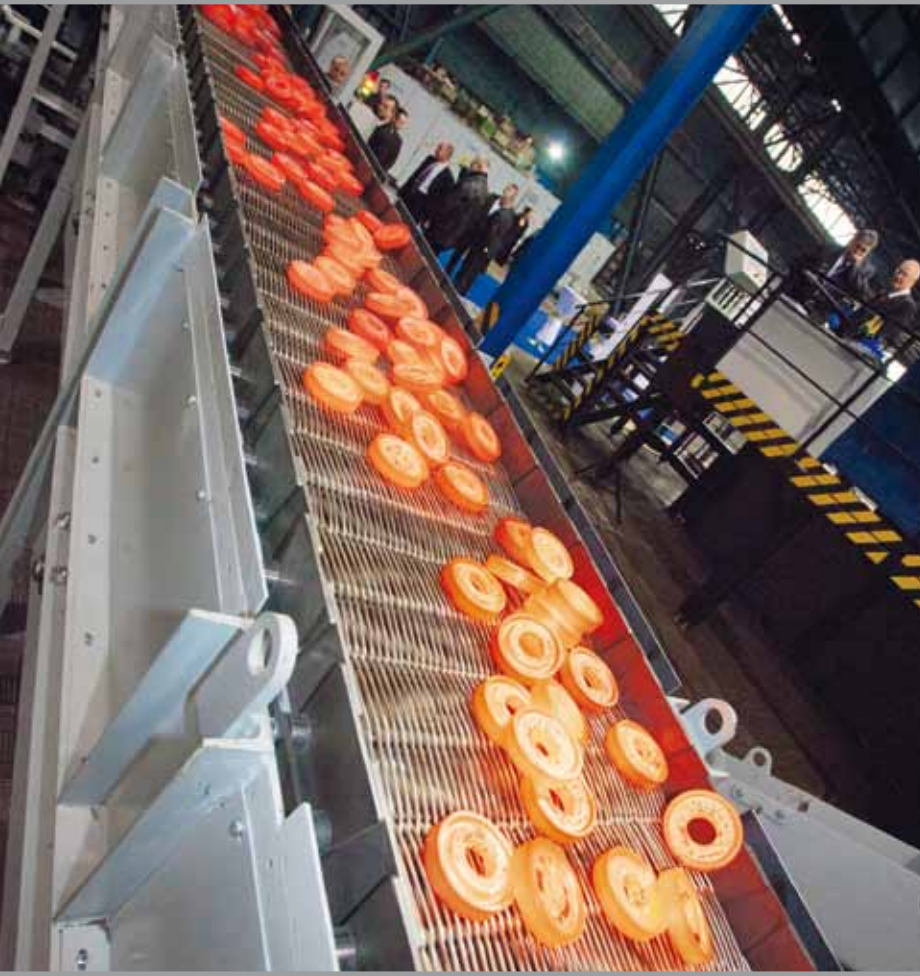
The production of the first hot parts during the inauguration event.