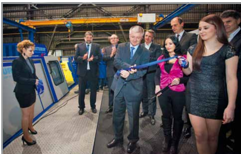
The celebratory inauguration of the machine with the cutting of the ribbon by the Minister of Economy of the Slovak Republic, Pavol Pavlis.

the new machines (in addition to the AMP 50 XL, we've acquired a new furnace and a blasting system). We were able to divide the production facilities into two separate lines, one for the automotive and one for the bearings sector.