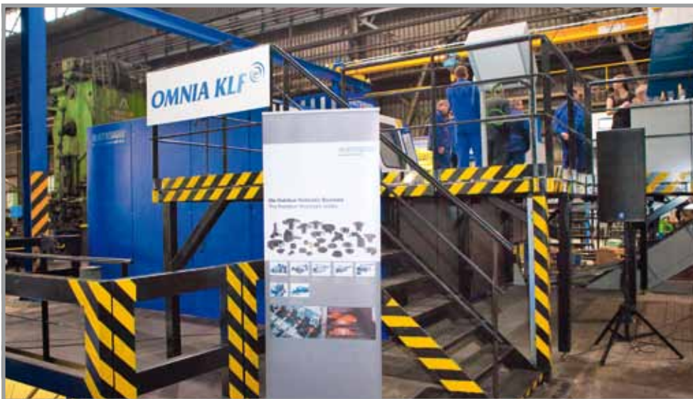
The new AMP 50 XL perfectly enhances OMNIA’s range of hotformers and greatly expands its opportunities.

PD: After production, the parts are annealed, subjected to a 100% visual check, and then turned internally or directly at our customers’ premises. Then, our customers process them further depending on their intended usage and finally assemble them in the end product.